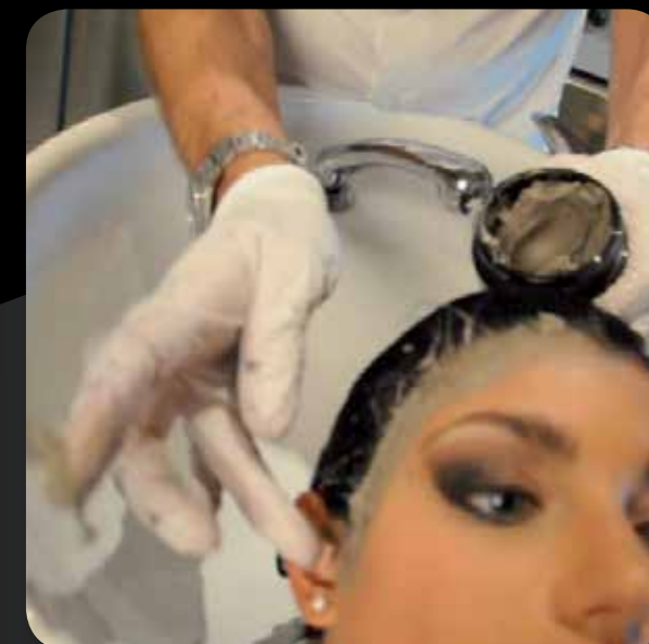
Stain remover application