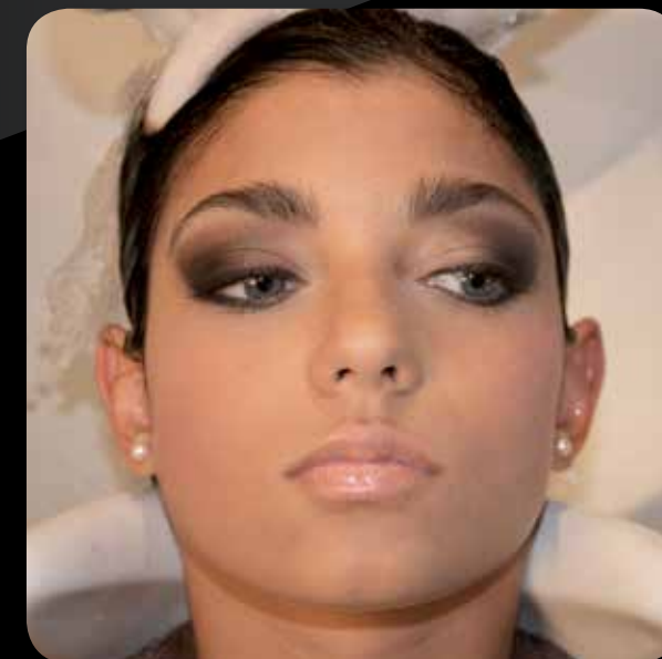
Final result after rinsing